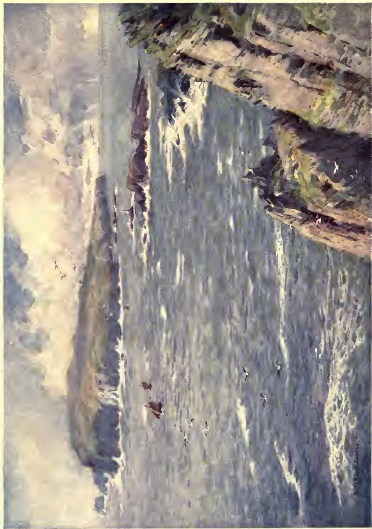
THE CALF OF MAN, FROM SPANISH HEAD. The Calf is at the southern extremity of the island and is separated by the narrow and dangerous Calf Sound, on the right of the picture.